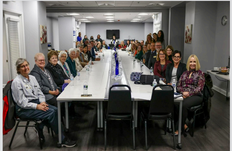
GACS Staff, Board Directors and supporters gather on October 19, 2022