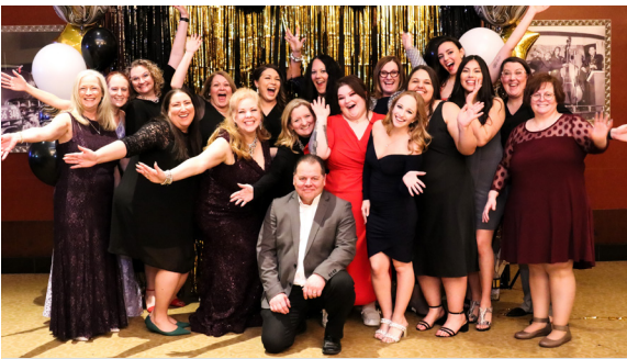
GACS Staff gather for a group shot at the end of a successful evening of fundraising