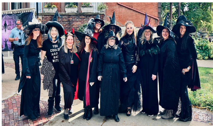
GACS staff volunteering as the "Gatekeepers" at Witches Night Out 2022

Every year during October: Domestic Violence Awareness Month (DVAM), GACS participates in many awareness events and activities. October 2022 was no exception! We had a successful awareness month, hosting and participating in a variety of events including: Grundy County Take Back the Night, Will County Take Back the Night, Witches Night Out, and our Angels Against Abuse 5K.