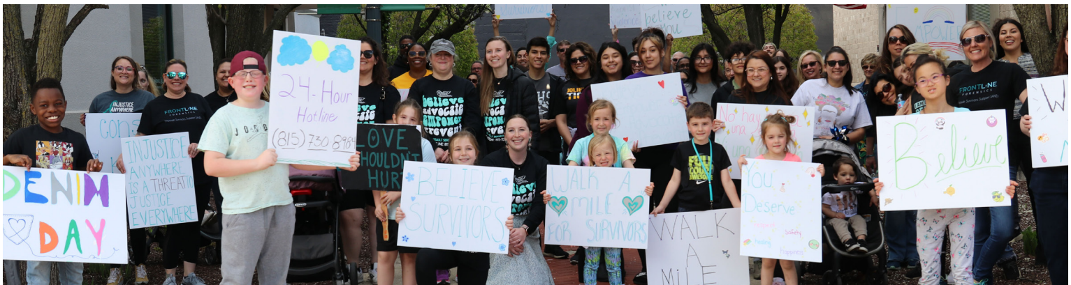
Walk a Mile attendees gather for a group photo halfway through the mile-long march in Downtown Joliet

The month of awareness activities concluded with "Walk a Mile" held at the Joliet Public Library, downtown location, on April 27th. The event featured a rally, survivor speaker, raffles and awareness activities followed by attendees participating in a mile-long march around the area sidewalks to bring attention to sexual assault & gender-based violence. More information on the annual awareness events and Sexual Assault Awareness Month can be found at gacsprograms.org/saam .