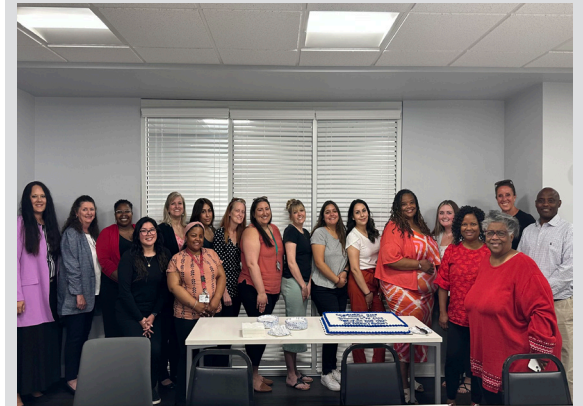
The DCFS Performance Monitoring Team (APME) and high ranking DCFS officials honored GACS Foster Care staff by coming to the agency with a beautiful cake.