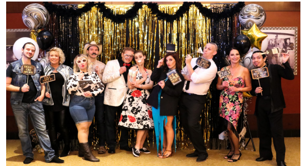
2023 Past Champion Dancers and Dance Professionals strike a pose before the competition begins